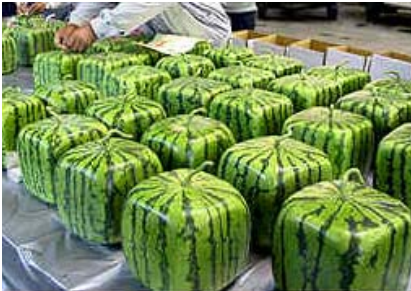
Non-standard or new standard?

This newsletter edition promotes the work of standards bodies in the displays area and emphasises that the displays community should actively care about the making and application of standards.